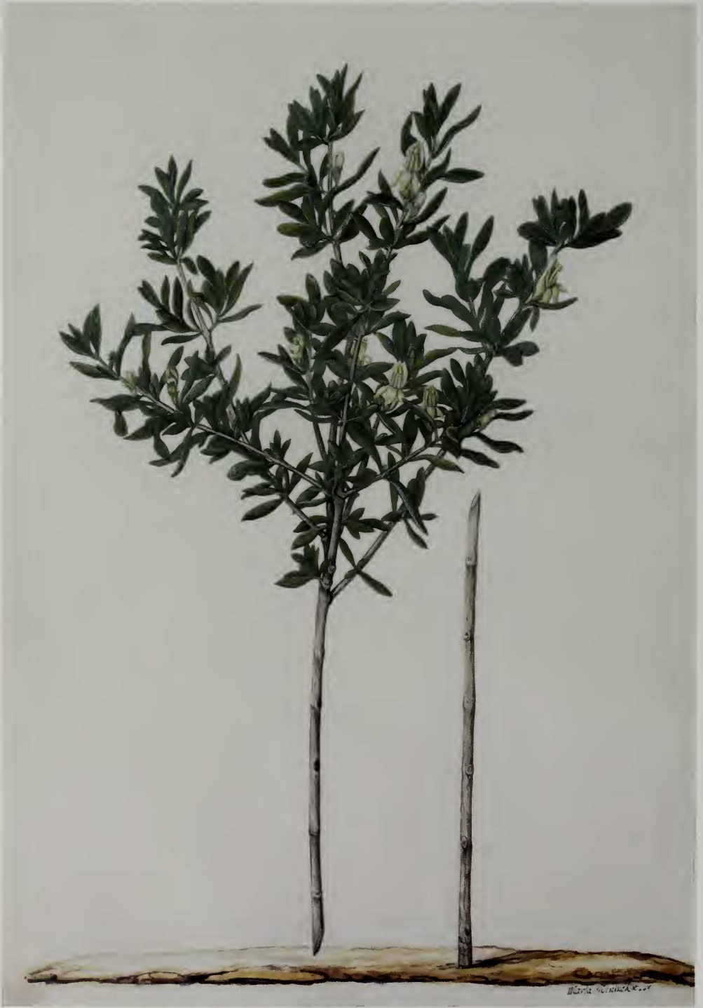
Figure 13.- Watercolor of Justicia hyssopifolia located at the Moninckx Atlas (vol. 8, t. 38) made Maria Moninckx. Unknown date between 1686 and 1706.